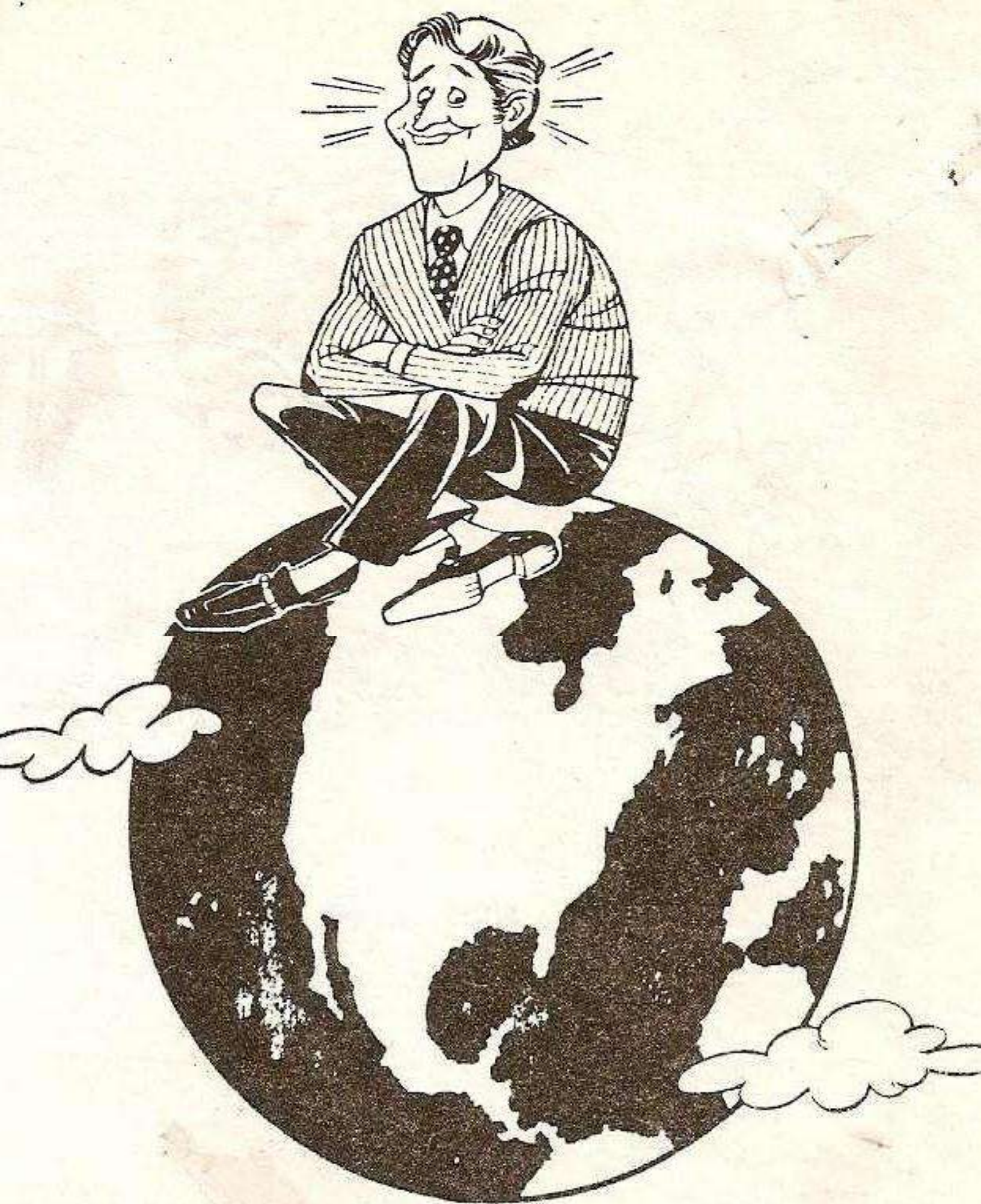
Successful project completion.